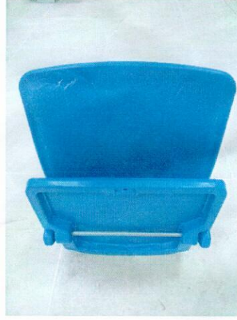
Figure1. Foldable Stadium Seat samples.

Foldable Seat samples (Figure 1) which produced by Yücel Bahçe Mobilyaları San. ve Tic. A.Ş. have been evaluated according to EN ISO 4892 standard. Obtained results were given following: