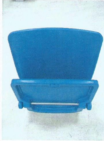
Figure1. Foldable Stadium Seat samples.

Foldable Seat samples (Figure 1) which produced by Yücel Bahçe Mobilyaları San. ve Tic. A.Ş. have been evaluated according to EN 13200-4 standart. Obtained results were given following: