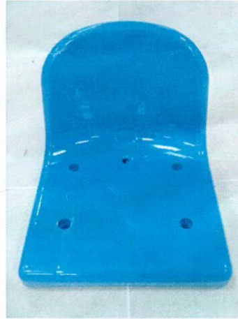
Figure1. Fixed Stadium Seat samples.

Fixed Seat samples (Figure 1) which produced by Yücel Bahçe Mobilyaları San. ve Tic. A.Ş. have been evaluated according to EN ISO 4892 standard. Obtained results were given following: